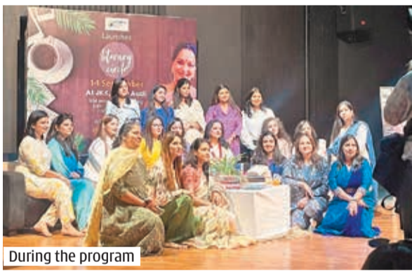
During the program

Khela National Comedy Drama Festival and Samvad Pravah, organised under Kala Sansar in collaboration with the Department of Art, Culture and Archeology, Rajasthan, Jawahar Kala Kendra and Curio A Group of Performing Art Society, Jaipur, started on Thursday. The famous actress Himani Shivpuri inaugurated the function. On this occasion, the play 'Khoobsorat Bahu' was staged under the di-