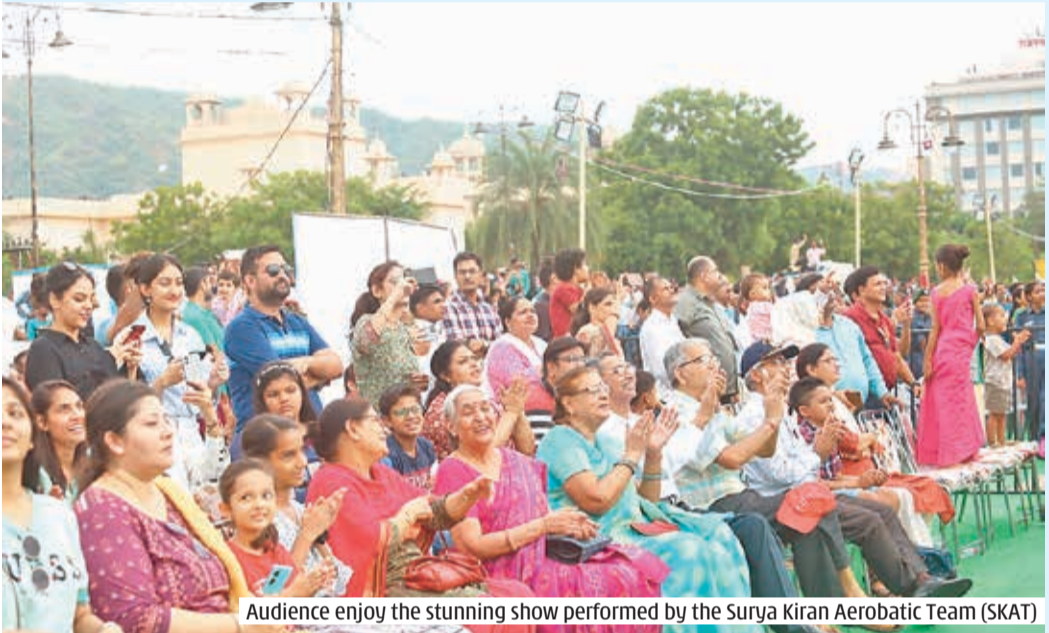
Audience enjoy the stunning show performed by the Surya Kiran Aerobatic Team (SKAT)

The air display was open to the general public along with students from schools and colleges, Civil dignitaries, NCC cadets, serving and retired defence personnel and their families. Two more shows will also be organised on Saturday and Sunday from 3.30 PM to 4.30 PM.