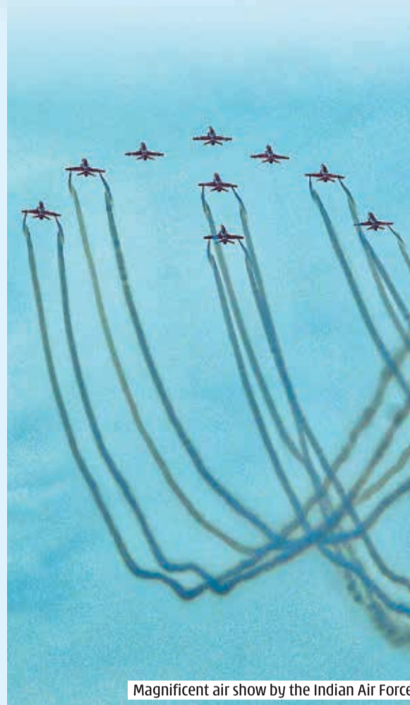
Magnificent air show by the Indian Air Force