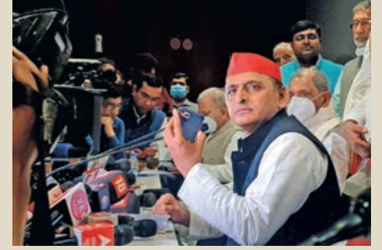
Akhilesh Yadav at a press conference in Lucknow.