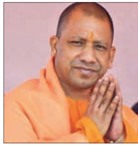
Problem solver Yogi.

A whopping 8.43 lakh matters related to registration of names of the successors have been settled while the remaining ones are in the different stages of solution, an official spokesman said.