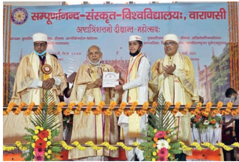
Governor Anandiben Patel awarding degree to a student during the convocation ceremony of the Sampurnanand Sanskrit University, Varanasi, on Tuesday. The governor awarded degrees to 14 students and presented medals to 57.