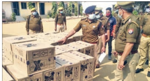
Police after a illegal liquor haul

In this connection the excise department has sought the services of village watchmen to