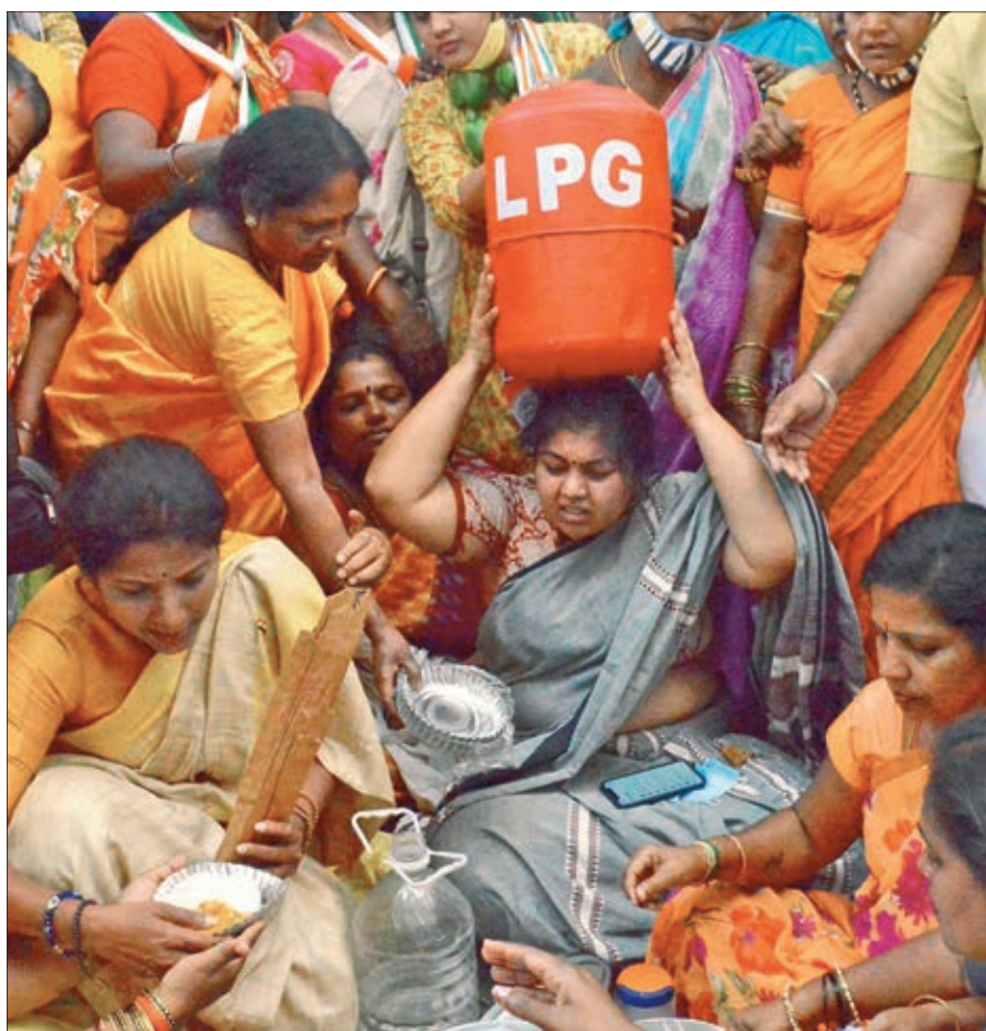
Congress Women Wing staged a protest against a price hike on LPG gas, in Bengaluru on Tuesday.

The Nirmala Sitharaman-led ministry has started consultations with some states, oil companies and the oil ministry to find the most effective way to lower the tax burden on consumers without federal finances taking a big hit, the sources said. "We are discussing ways in which prices can be kept stable. We will be able to take a view of the issue by mid-March," said one of the sources. Government wants oil prices to stabilise before cutting taxes.