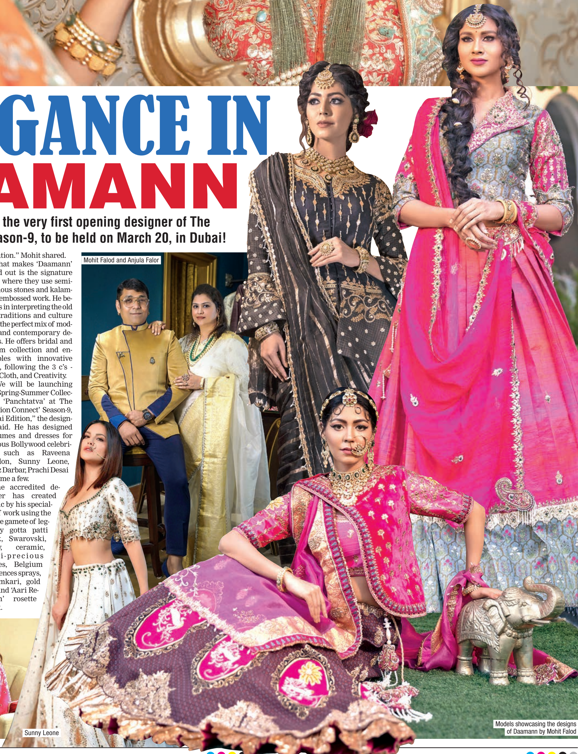
Models showcasing the designs of Daamann by Mohit Falod