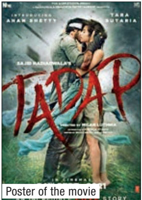
Poster of the movie

T ara Sutaria's massive fan following got a big surprise this morning as producer Sajid Nadiadwala released the first look poster of his upcoming movie Tadap. The movie will feature Tara in the lead and also marks the debut of Suniel Shetty's son Ahaan Shetty. The first look poster of the movie took over the social media by a storm and the entire showbiz world welcomed Ahaan wholeheartedly for his debut film.