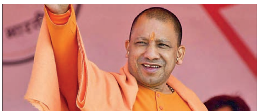
Chief Minister Yogi Adityanath's midas touch will soon be transforming Ayodhya.

The State government has also allocated a sum of Rs 1000 crore, including purchase of 555.66 acres of land for the UP