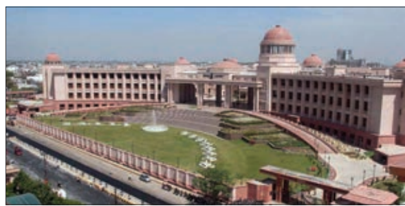
Lucknow High Court bench.