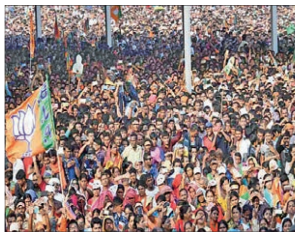
People thronged for CM Yogi's rally in large numbers in Malda.