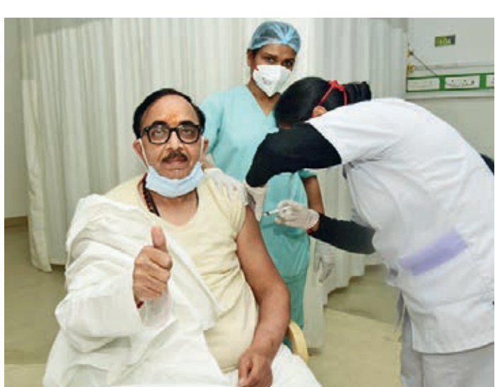
Union Cabinet Minister Skill Development and Entrepreneurship Dr Mahendra Nath Pandey got vaccinated at Yashoda Hospital, Kaushambi, Ghaziabad on Tuesday.