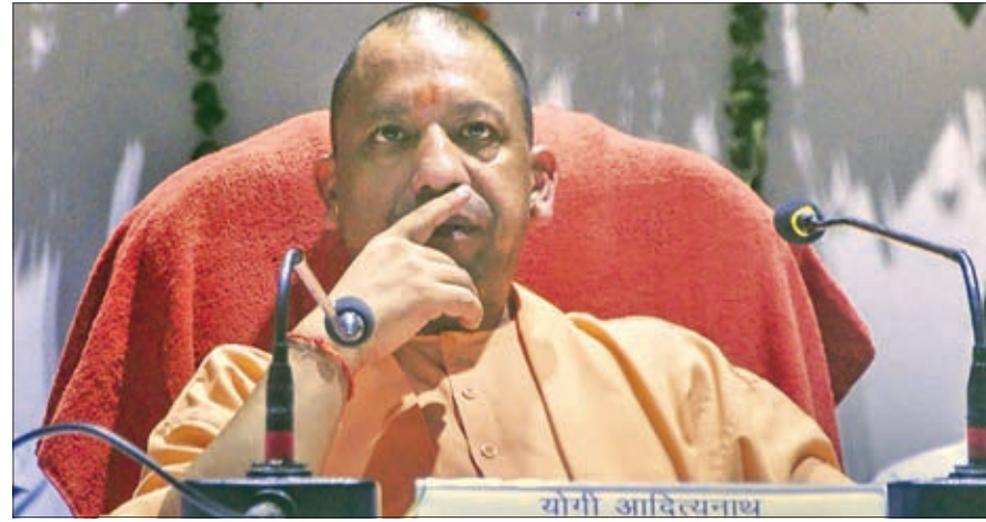
Chief Minister Yogi Adityanath

Lucknow: The BJP set in motion plans for Mission-2022 by coming up with a budget which many termed as a progressive one. These plans will now be further enhanced by organising programmes across the state in the celebration of four years of the Yogi government. The Yogi government will launch a campaign to showcase the achievement of the government from door to door on March 19. While presenting the final budget, the government had put forth five big political messages in the budget to keep its core agenda Hindutva and its urban core vote bank, along with youths, farmers and women. The programmes organised for the celebra-