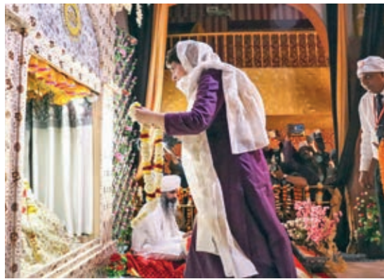
Congress leader Priyanka Gandhi Vadra visited Ravidas temple, Seer Goverdhan.