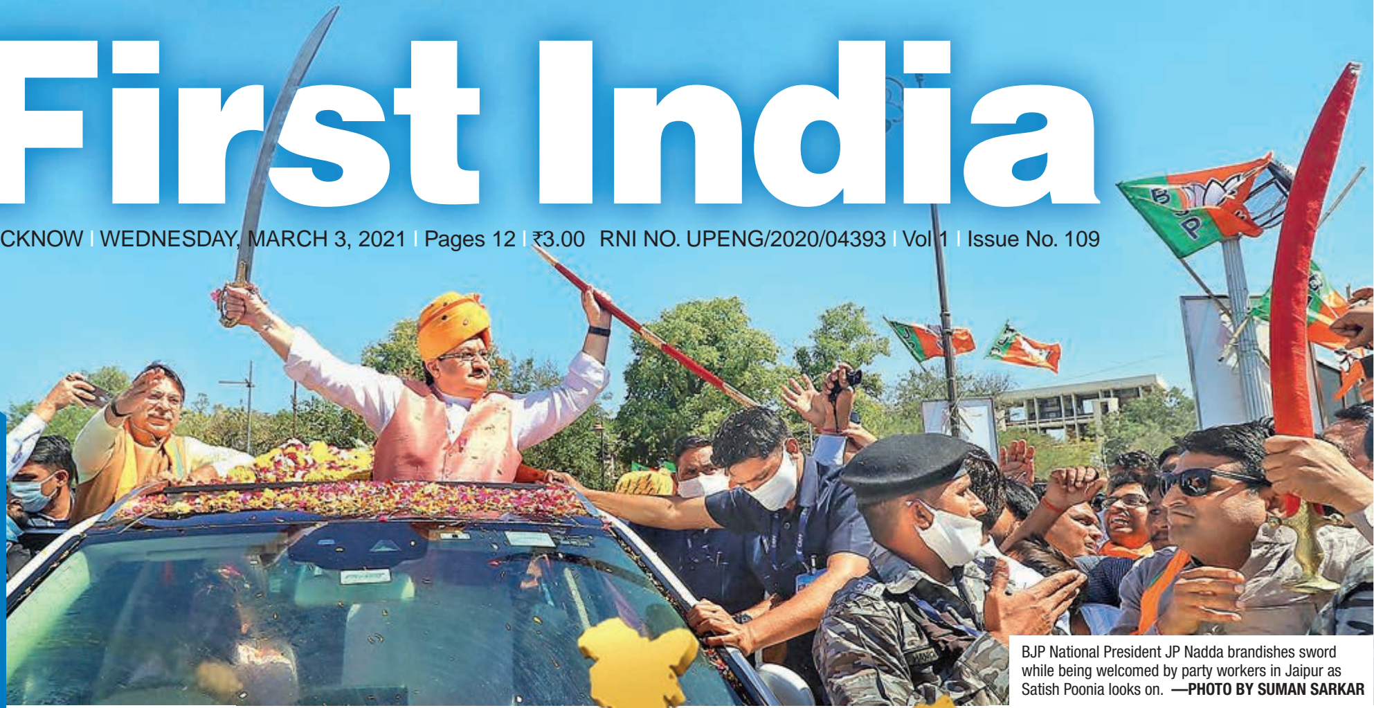
BJP National President JP Nadda brandishes sword while being welcomed by party workers in Jaipur as Satish Poonia looks on.