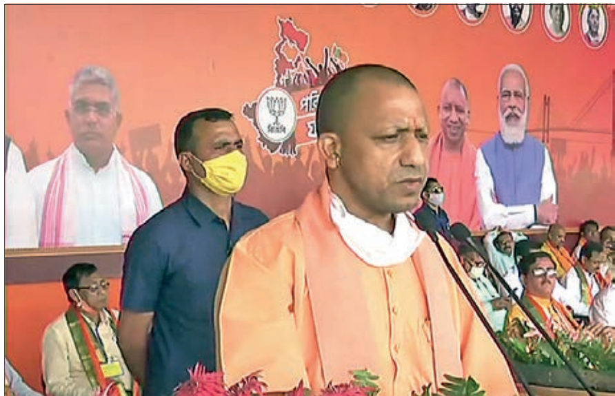
UP CM Yogi Adityanath lambasted the West Bengal govt at a rally organised in Malda on Tuesday.