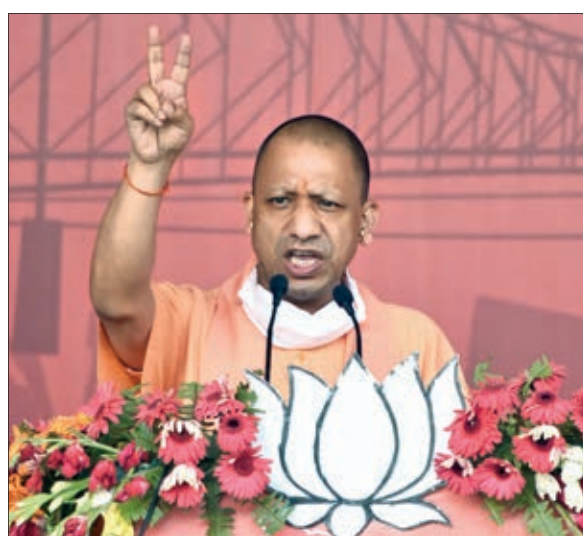
CM Yogi addressing the rally in Bengal. He fired fresh salvo against Mamata Banerjee on Tuesday.