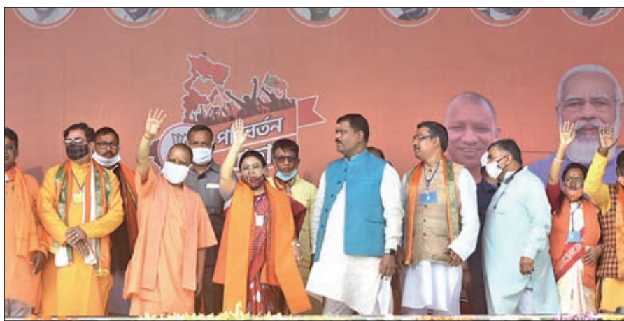
BJP leaders and party workers accompany CM Yogi Adityanath on stage.