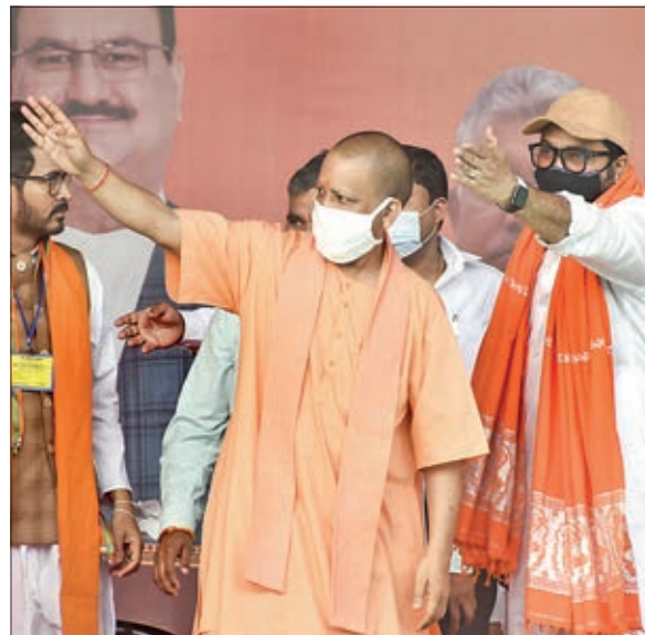
BJP MP Babul Supriyo with CM Yogi Adityanath.